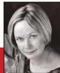
Sena Jeter Naslund