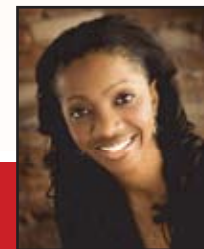
Kimberla Lawson Roby