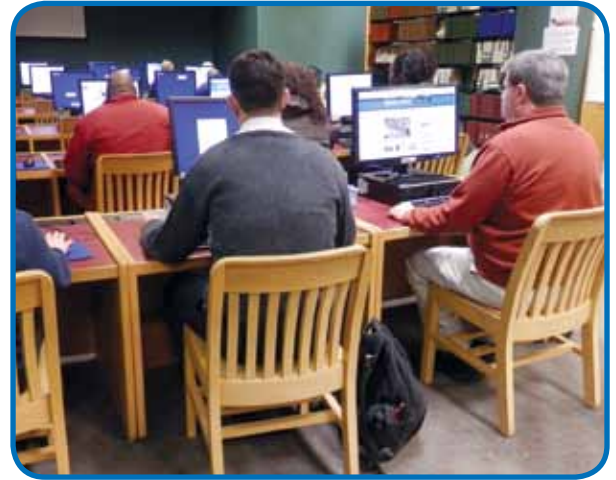
The Computer Training Center is located on the second floor of the Main Library downtown.

To qualify for the exam, call 256-532-2356 to make an appointment for a free practice test and a short interview/survey. Passing this test is required to show that you have the basic skills to take a certification exam. For details about MOS certifications, visit guides.hmcpl.org/MOS . Find a schedule of classes and more information about the Computer Training Center at hmcpl.org/computers/training .