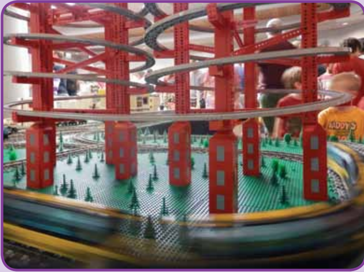
LEGO Extravaganza @ Main June 21-22