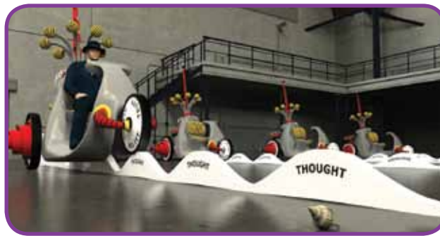
A still shot from the short film “A World of Difference”

Program 2 offers a variety of shorts, including “A World of Difference,” an eight-minute Directors’