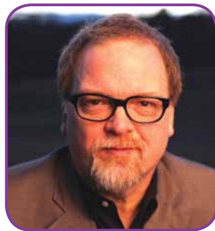
Novelist Greg Iles

Greg is also the author of The Devil's Punchbowl , Third Degree , True Evil , Turning Angel , and more. Stephen King calls Greg's Sleep No More "a thriller that really thrills, a shocker that really shocks."