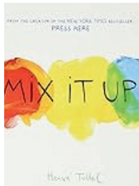
Mix It Up Herve Tullet