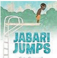
Jabari Jumps Gaia Cornwall