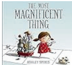
The Most Magnificent Thing Ashley Spires